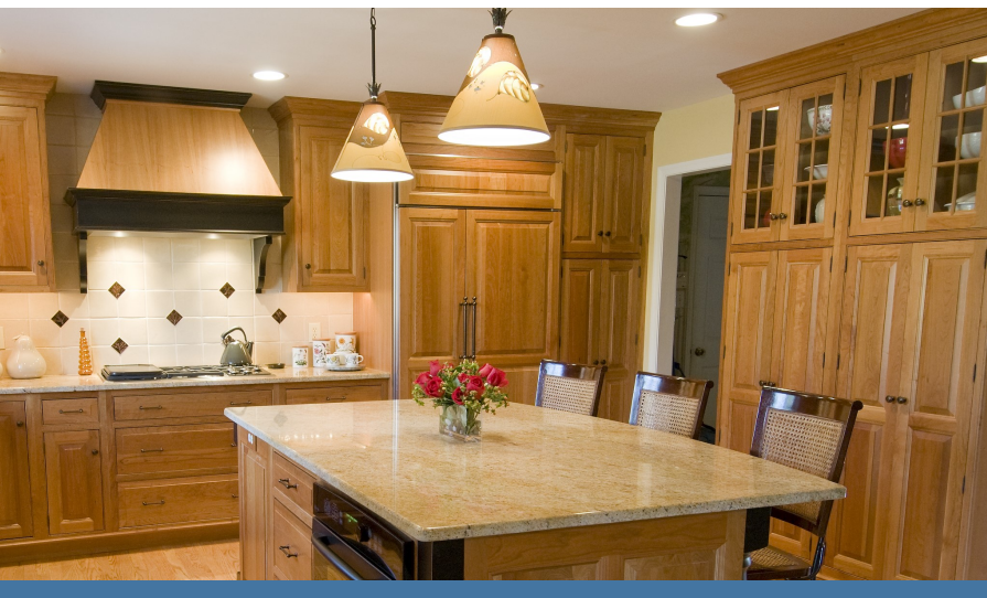
Remodeling in 2018?

Schedule your complimentary in-home meeting (856)235-4237 or info@rcraiglord.com